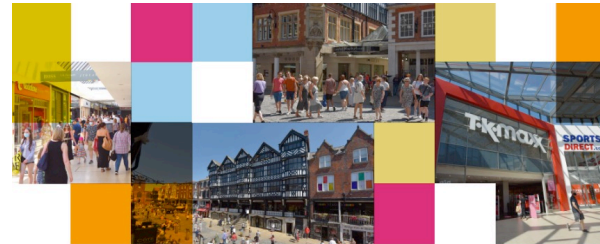
Grosvenor Shopping Centre | Chester Dominant mixed-use retail and hotel investment opportunity